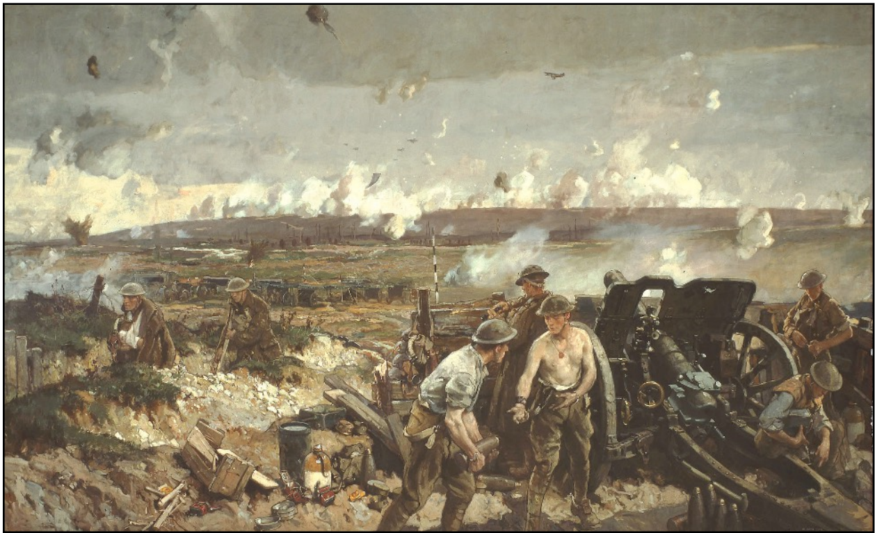
The battle of Vimy Ridge. Canadians worked together to make a major breakthrough in the war.