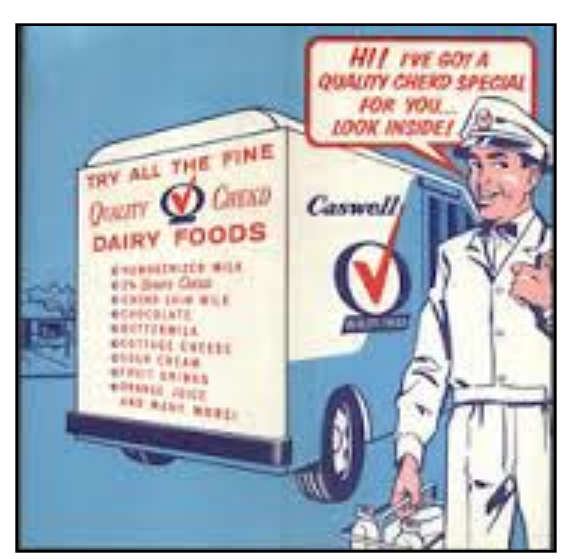
Quality Chekd products at Caswell's included homogenized milk, 3% skim milk, chocolate milk, buttermilk, cottage cheese, sour cream, fruit juices and orange juice.